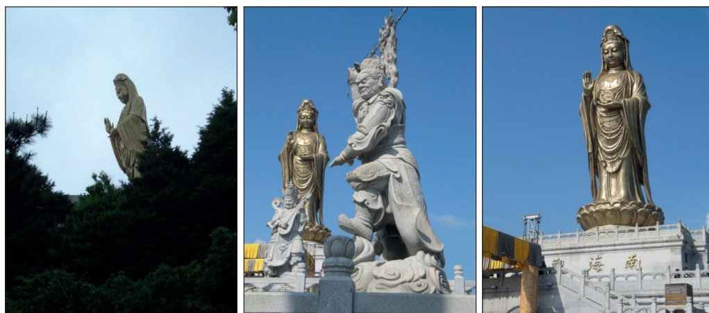
Fig. 1. “The Buddhist Paradise amidst the Sea and the Sky” on the Zhoushan Archipelago