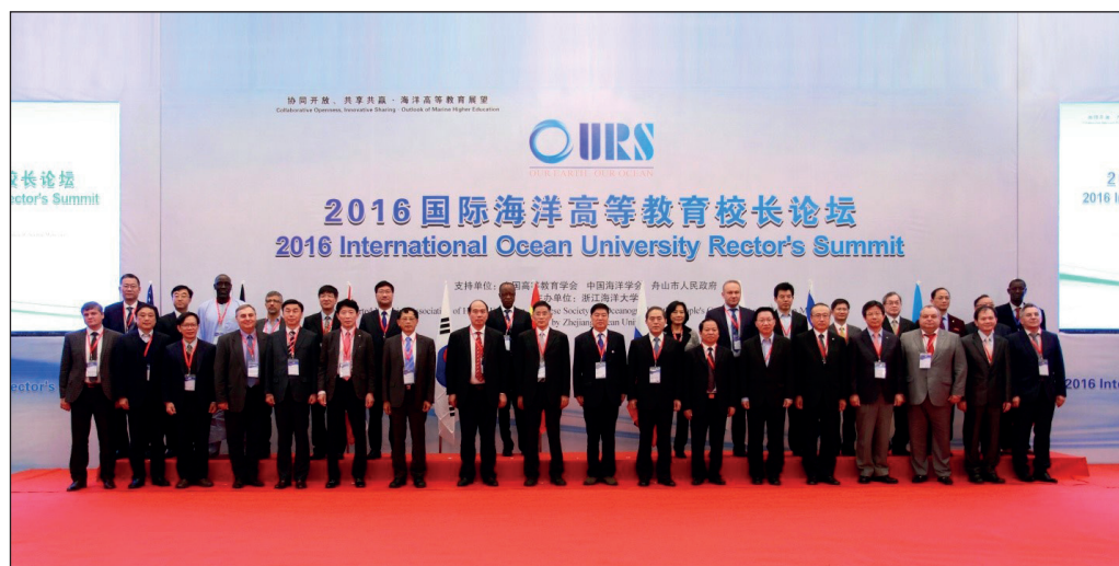
Fig. 5. The group photo of rectors and vice-rectors – delegates of the Summit-2016