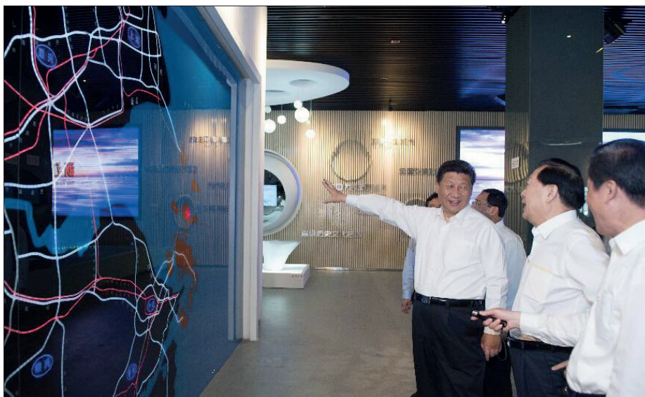
Fig. 4. President Xi Jinping: “The development and opening of Zhoushan is strategically significant at regional and national levels”

The University has 10 schools, 3 research institutions, and over 1300 full-time faculty and staff members, among which 249 professors and 413 PhD experts. There are over 15 800 full-time students.