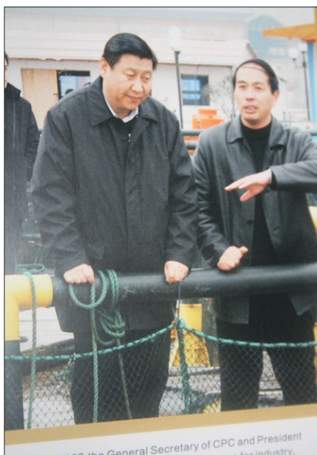
Fig. 3. Zhoushan is the foreground of the development of China’s marine industry

In the last few years, the ZJOU, as the center of higher education, has undergone an all-round and sustainable development. It is a province-affiliated institution educating in four main fields – ocean science, fishery, naval architecture and ocean engineering, with a multi-disciplinary coordinated development of science, agronomy, engineering, liberal arts, economics, management and pedagogy. For about 60 years, the ZJOU has persisted in running a school on the islands, having made great contributions both to the marine talent education in the East China Sea, and to the sustainable development of fishery and aquaculture, as well as the transformation and upgrading of the whole marine economy.